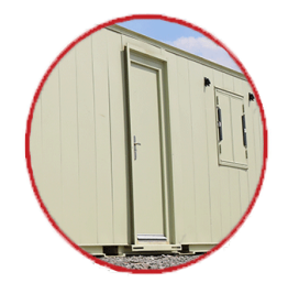
Multi Point Locking Steel Door